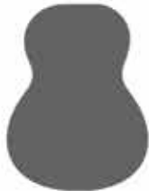
LS Small Body