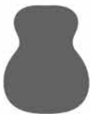
OM Orchestra Model